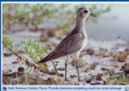
BBi includes over 15,000 published images. Instantly locate and display all photos of a given species.

Cover photo Red Grouse